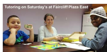
Tutoring on Saturday's at Faircliff Plaza East