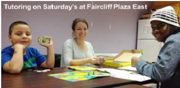
Tutoring on Saturday's at Faircliff Plaza East

YEP Art Club YEP Reading Club YEP Garden Club Adopt-an-Apartment Program Volunteer Work Days Special Events